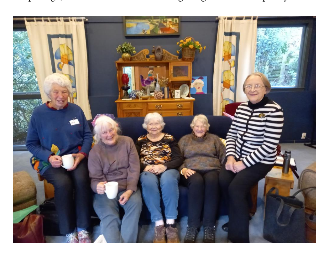
What has your Special Interest or Study Group been doing lately? We would love to see your photos

The members of the Espionage Study Group had some lively and interesting discussions about espionage, as well as about a whole range of general contemporary issues.